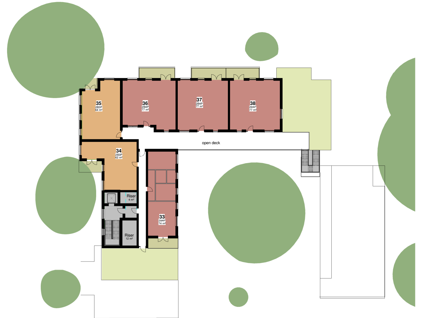
Fourth Floor 1 : 200