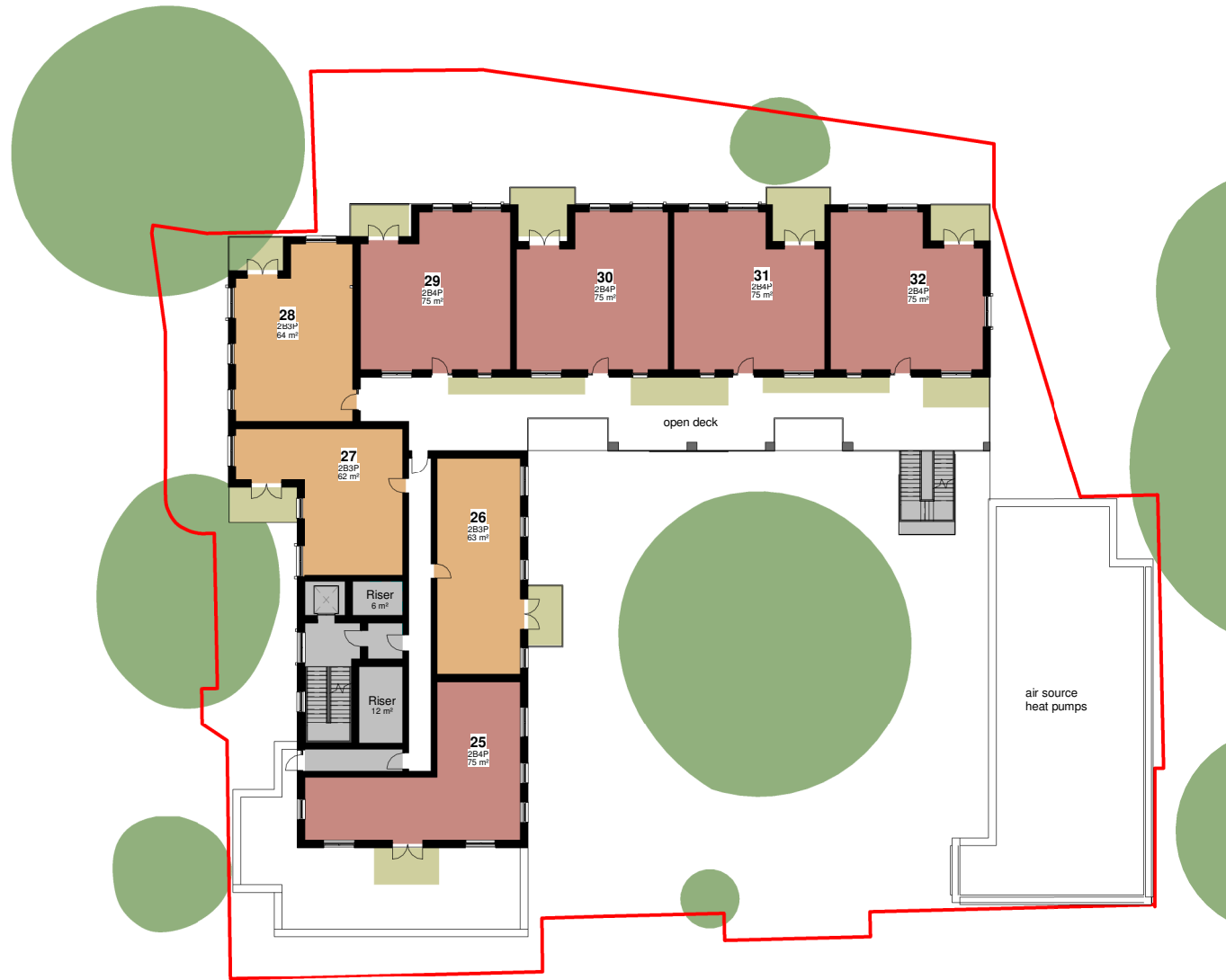
Third Floor Plan 1 : 200