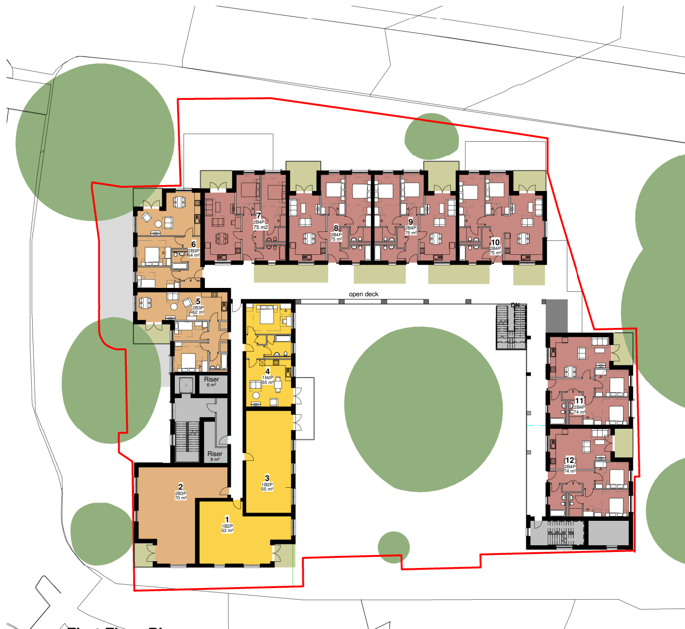
First Floor Plan 1 : 200