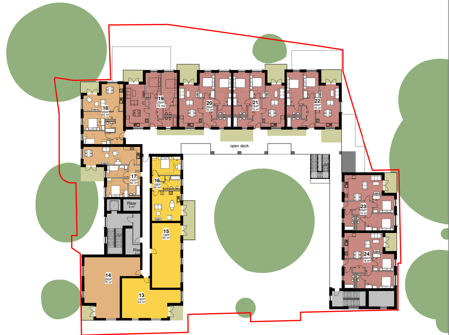
Second Floor Plan 1 : 200